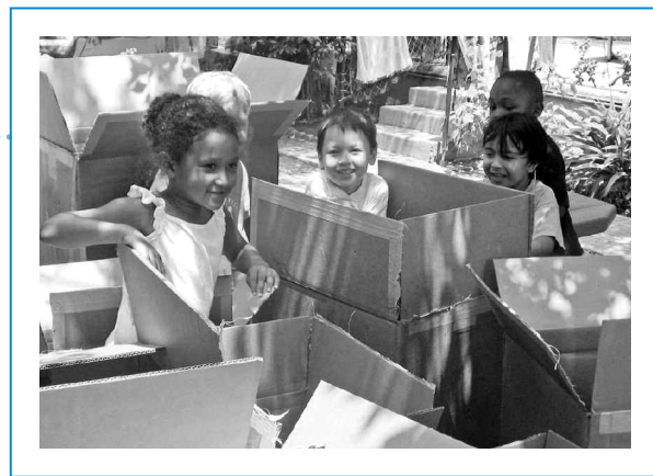
The kids at Altadena Christian Children's Center enjoyed a back-to-school surprise as new tables and chairs funded by a grant from PCF were delivered. These will replace 15-year-old plastic chairs and well-used tables.

Total Grants: $210,611 Grants Funded: 19 First Grant: 1986 – $2,296 2008 Grant: $10,000 to replace Learning Center Desks