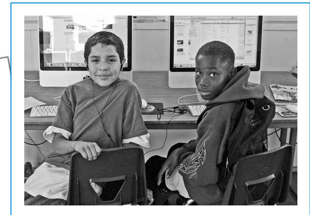
Pasadena Youth Center (PYC) provides programs to youth to learn about careers and the training and skills required to attain them.