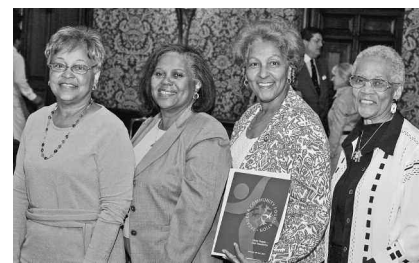
The Pasadena Delta Foundation is a PCF Legacy Society member.