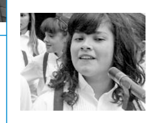
Child Health Collaborative celebrated Washington Middle School's expanded health