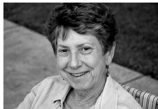
As a resident of Pasadena, she felt that the Pasadena Community Foundation was the perfect entity to help administer the fund which will support charities that have a proven track record in this field