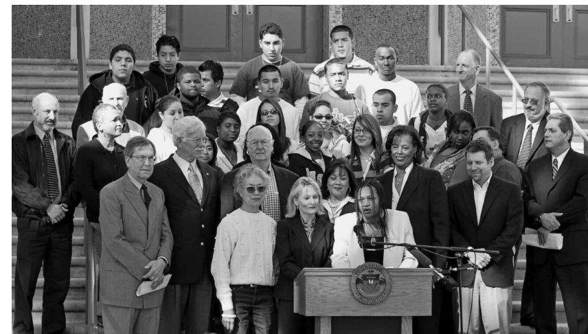
The Pasadena Community Foundation announced plans to award almost half-a-million dollars over three years for a new Youth Initiative.