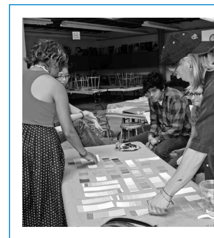
Art High: Bringing the Power of Art into the Lives of Teens

35-Year Grant Funding History: Total grants: $298,495 First Grant: $1,000 art workshop equipment 1973 2007 Grant: $8,000 Art High Program